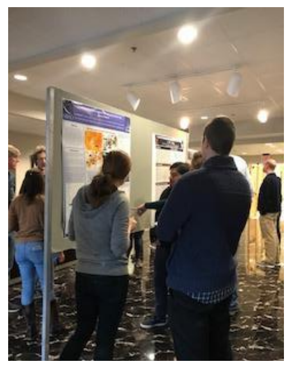
ALMA Ambassadors and NAASC Staff at the poster reception during the Ambassador training session – 2019 February