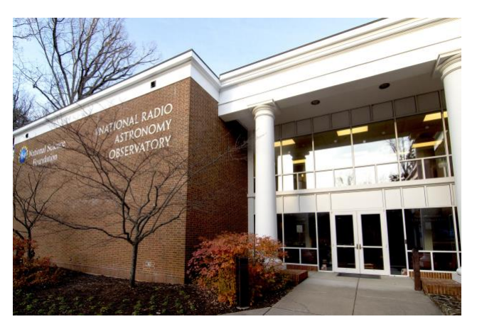
Stone Hall on the Campus of the University of Virginia and headquarters of the North American ALMA Science Center.

Each astronomer who uses ALMA is assigned an ARC for user support at the time they register with the ALMA Science Portal and when they update their affiliation. Astronomers in North America, East Asia, or Europe are assigned to the ARC associated with their region. Astronomers from Taiwan can select either the NA ARC or the EA ARC. Astronomers elsewhere in the world can select any one of the three ARCs.